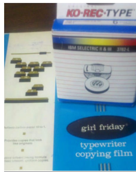
Above: Girl Friday carbon paper!