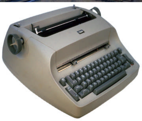
<u>Above</u>: Which is from a museum and which from our office?!

The first known use of purge was in 1563 and more common in religious matters, as in cleansing or purifying the body or soul. Later uses referred to clearing one of guilt or to making one free from something -- whether by fasting or by political upheaval. We didn't need professional purgers or movers to just change floors; we're happy to stay in our wonderful downtown art-deco building.