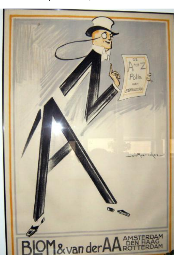
Vintage poster for "A-to-Z" insurance policy