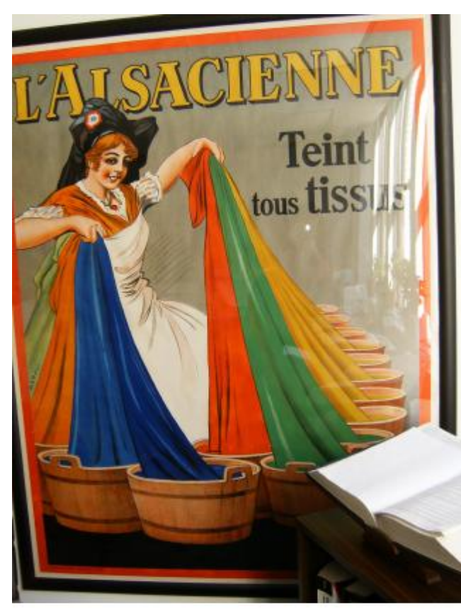
Vintage poster of Alsatian fabric dyer overseeing our favorite Merriam Webster's Third International Dictionary

Since 1973, we've been occupying the premises at 29 Broadway in New York City -- yes, just a few short blocks from the other Wall Street Occupiers -- and invite you to visit us to see what occupies our wall space in Suite 2301 -- scroll down to this month's LINGUAQUIZ question #3, below!