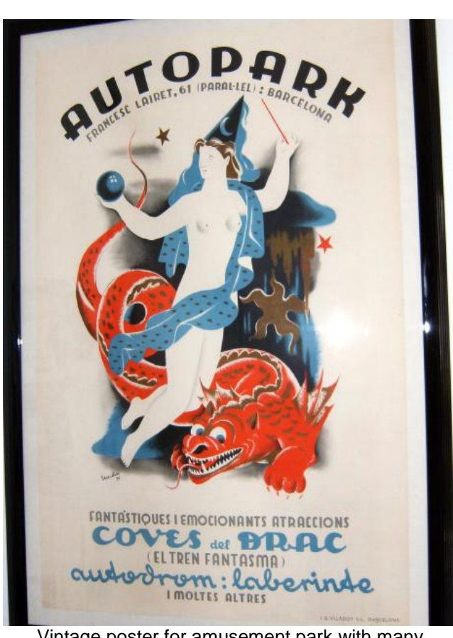
Vintage poster for amusement park with many "fantastic attractions"